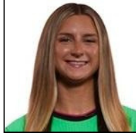
#4 Emerson Elgin Defender ELL-jin