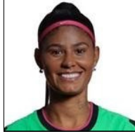
#3 Kaka Defender Ka-ka